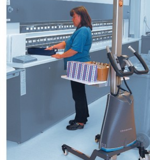
Extremely maneuverable, even more versatile